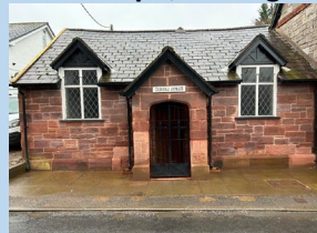
Our Lady, Help of Christians, Ruthin