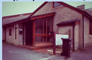
St Winefride, St Asaph