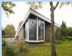
St. Joseph, Denbigh