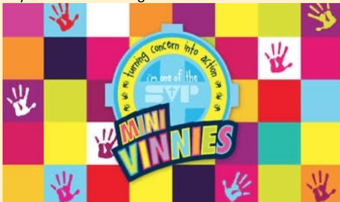
Ideas and artist's impressions:

In practice, this included collecting food for the local Foodbank and delivering it to the local distribution point. Entertaining elderly members of the parish is an annual event at the St Nicholas' Tea Party held just before Christmas. The enthusiasm and range of talents seen was uplifting with singing, gymnastics, drumming and dancing. The children mingled with those present providing company and raised the spirits of all. The final Christmas carol sent everyone out with their spirits high. Looking further afield, the pupils at the school collected pens and pencils to fill a suitcase to be sent out with a volunteer teacher to pupils in Malawi. This was putting into practice the need to help and support each other as Mini Vinnies to build a better world. The enthusiasm of the pupils in helping others has been truly inspiring. Long may this continue and grow.