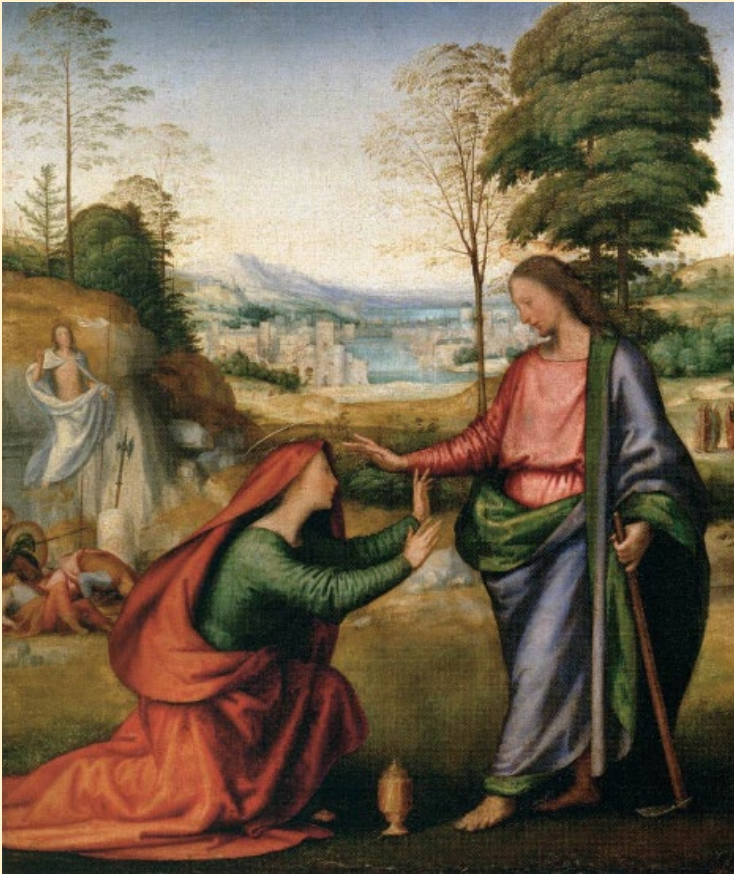
Fra Bartolomeo, Noli me tangere (c. 1506)

In this monthly reflection, St Beuno's Outreach invites you to pray with an image and a verse of Scripture or other material.